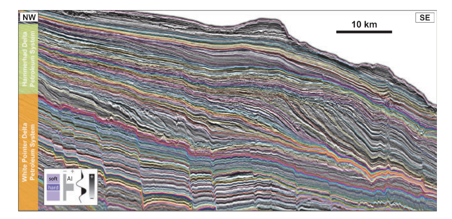
Fig. 1. Partially-automated stratigraphic framework built from the Springboard MC3D Full-Stack PSDM Volume.

Faults were mapped in time throughout the 8001 km<sup>2</sup> survey area, from the Jurassic syn-rift to the Cretaceous post-rift sedimentary sections. Different structural styles were observed, with a clear difference in the orientation of the west-east normal faults between the Jurassic (Tithonian) system associated with the initial extension of the syn-rift period (deeper faults), and those of the Cretaceous (Cenomanian) gravity-driven listric growth normal faults, which detach downwards into the underlying mobile shales of the Blue Whale supersequence. The listric faults controlling this compartmentalised Cretaceous depocentre do not appear to breach the regional detachment separating the underlying Jurassic sediments; however, multiple detachments have been interpreted at this level, which appear to coalesce at depth to the southwest. These large-scale Cretaceous normal faults are the dominant structural mechanism in the study area, and prospective structural plays have been identified within the associated White Pointer petroleum system.