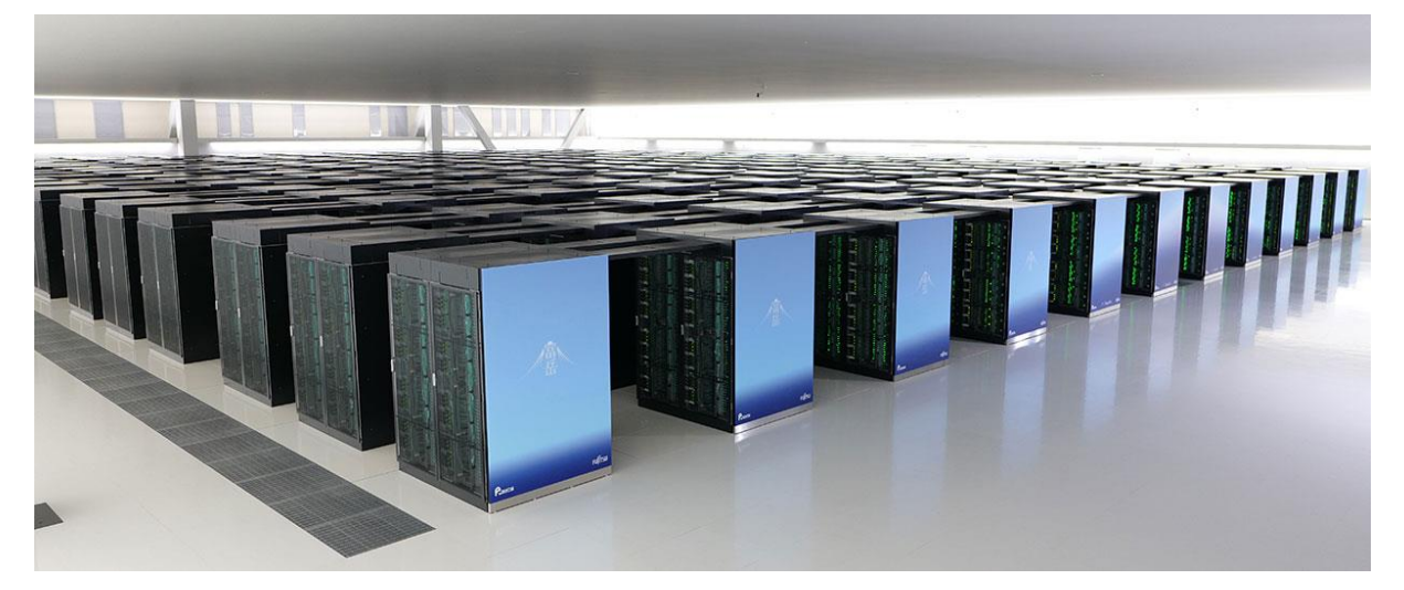
Figure 3. The Fugaku supercomputer facility at RIKEN Center for Computational Science (R-CCS) in Kobe, Japan.

Fujitsu claim their CPU is the world's first CPU to adopt <u>Scalable Vector Extension</u>—an instruction-set extension of Arm v8-A architecture for supercomputers. The 512-bit, 2.2-GHz CPU employs 1,024-gigabytes-per-second 3D-<u>stacked memory</u> and can handle <u>half-precision arithmetic</u> and (single-precision) multiply-add operations that reduce memory loads in AI and deep-learning applications where lower precision is admissible. The CPUs are directly linked by a 6.8-GB/s network Tofu D interconnect that uses a 6-dimensional mesh <u>torus connection</u>.