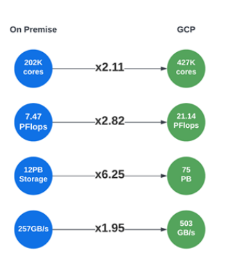
Figure 4. Milestones achieved to date by moving from on-premise to GCP: number of cores, petaFLOPS, storage, and bandwidth.

Figure 3. Preemption rate over a four-day period demonstrates how robust and fault-tolerant the workloads are. This workload peaked at about 52 782 instances and 1 231 385 vCPUs. A large proportion of instances had a higher vCPU count than the example in Figure 2 .