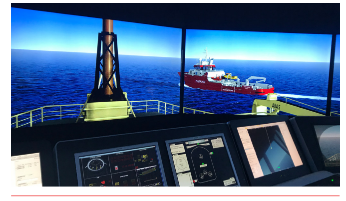
Figure 2. Simulation includes interaction between multiple vessels on the seismic operation. Here a support vessel passes the Ramform, and is manned by a team in a second bridge simulator.